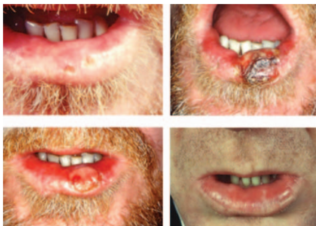
Figure 3 Photos of 2 small cancers on the lip before (top left), 4 days after photodynamic therapy (PDT; top right), 14 days after PDT (bottom left), and a month after (bottom right). Reprinted from Grant et al, Int J Cancer 1997;71:937–942; with permission.

Two other publications that appeared after the HTA report demonstrated conflicting results. Based on their review, Kiesslich et al 13 reported an average survival of 14 to 16 months with PDT plus biliary drainage for nonresectable hilar biliary tract cancer, compared with approximately 6 months for drainage alone. However, in the one negative RCT of PDT for cholangiocarcinomas and other biliary tract tumors, Pereira et al 14 showed longer survival in those treated with stenting alone than in those treated with stenting plus PDT (8.5 months vs 5.6 months). Finally, even more recently, Tomizawa and Tian 15 concluded that PDT could be regarded as a standard palliative therapy for unresectable cholangiocarcinoma, although the National Cancer Research Network (NCRN) dismissed these findings as being nonequivalent to those from a prop-